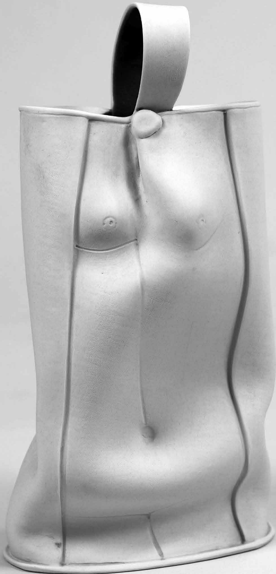
Title: Figure Vase Artist: Anita Rocamora Exhibition: Continuum