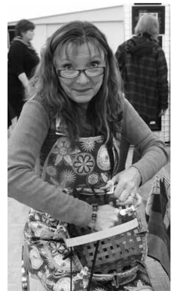
Artist: Beth Crabb WinterGreen Fine Craft Market