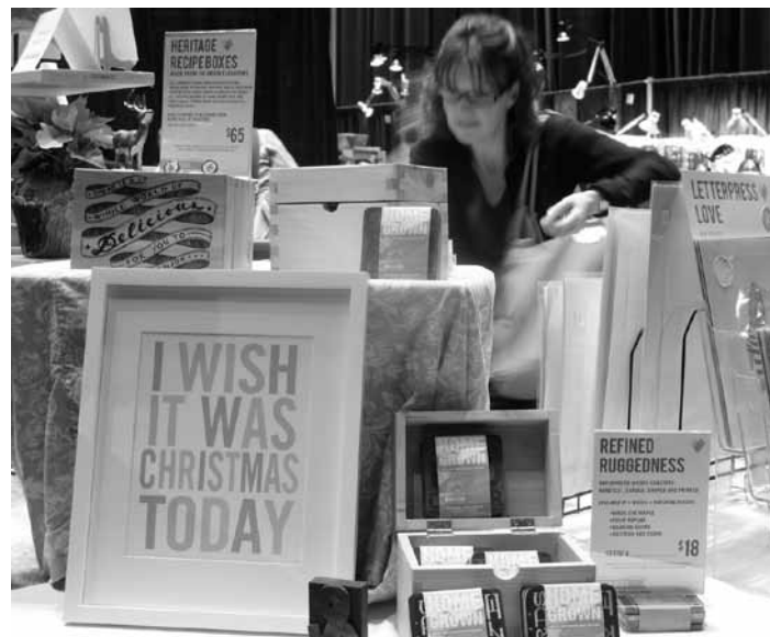
Shauna Buck Illustration & Fun Things WinterGreen Fine Craft Market