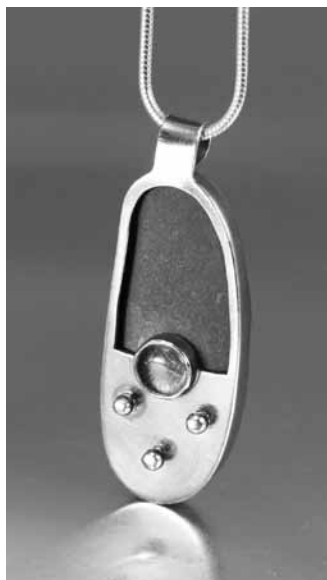
Necklace: Beach Stone with Amber Artist: Melody Armstrong