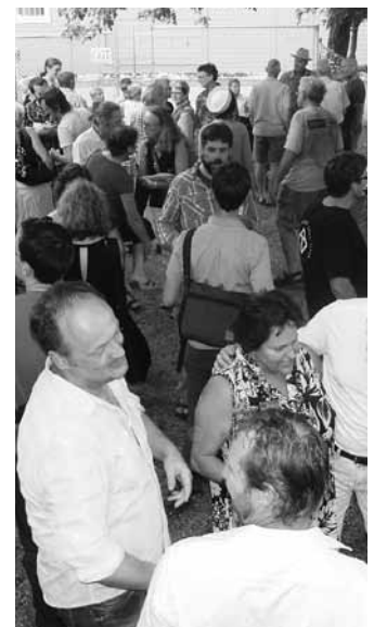
Affinity Gallery Reception Guests Exhibition: Decoy