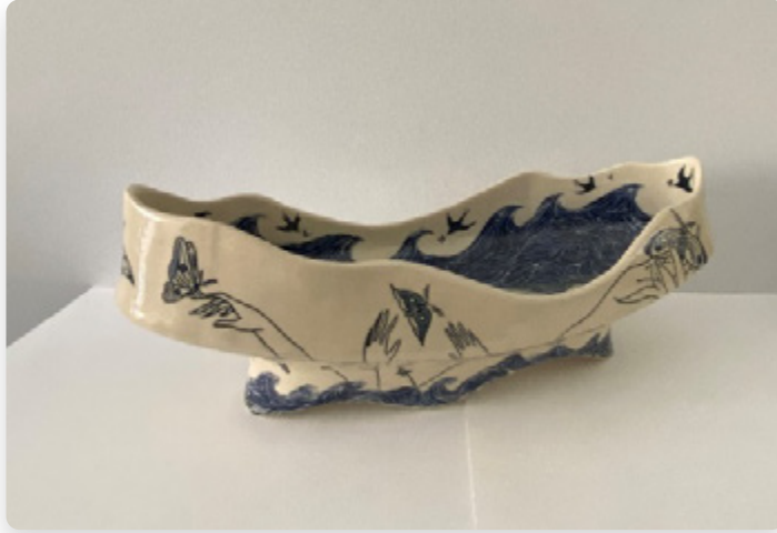
Example artwork: Maia Stark